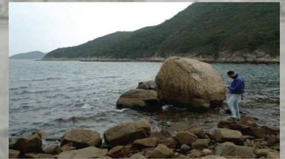
Kau Sai Chau — a large rock near Kau Sai Chau village that, according to local folklore, is the ligament of a scallop (pronounced 'Kau' in Cantonese) joining its two shells, the two represented by Kau Sai Chau and nearby Jin Island. It is the origin of the name Kau Sai Chau.

If you know of sites or have stories related to the Hong Kong's maritime and underwater cultural heritage, the HKUHG would be very keen to hear from you at hkuhgroup@gmail.com or call us at 9074 1785 .